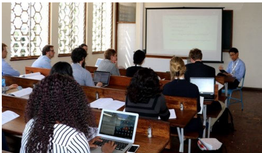
parallel session on conceptualizing planetary justice held at the Small Pathology Lecture theatre