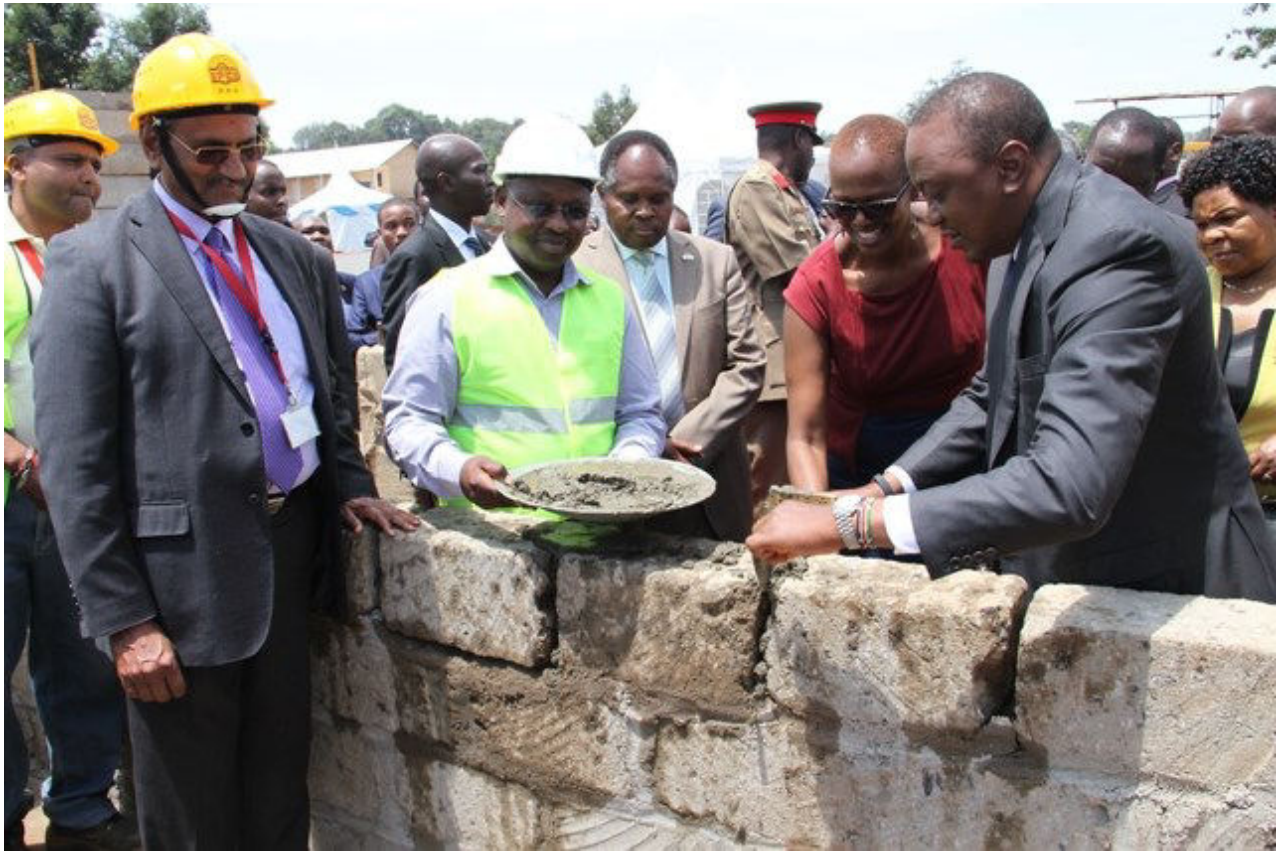
His Excellence, the President, Hon. Uhuru Kenyatta, laying the foundation stone for the WMI