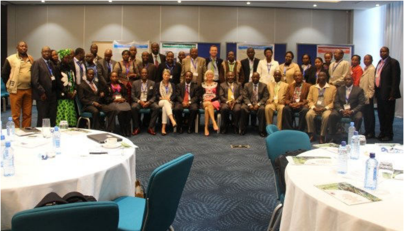
STAKE team at the Wangari Maathai Institute in conjunction with the University of Copenhagen, GBM, KEFRI and stakeholders holds National STAKE Conference

STAKE project at the Wangari Maathai Institute for Peace and Environmental Studies held a national conference on Tuesday July 12, 2016 at Radisson Blu Hotel, Upper Hill, Nairobi. The project is funded by DANIDA and is a collaborative project between University of Nairobi - Wangari Maathai Institute and University of Copenhagen in Denmark. With two partners namely Greenbelt movement and Kenya Forestry Research Institute that was carried out in Eastern Mau 2012-2014.