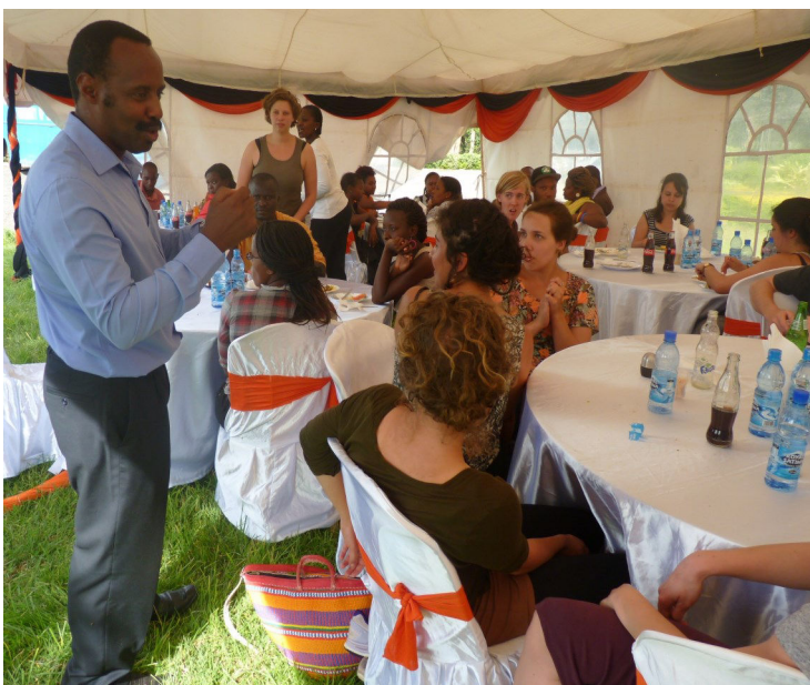
Dr. Thenya addressing the participants during the closing ceremony of the 2014 SLUSE Course