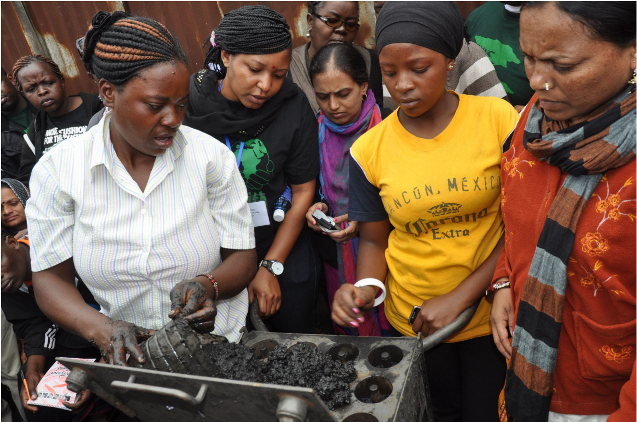
Photos: Participants being taught how to make briquettes from charcoal dust