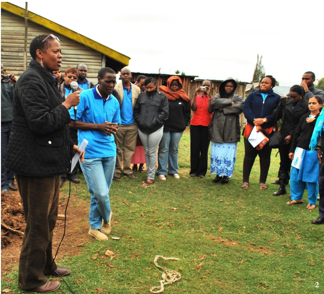
1. Participants making briquettes from charcoal dust