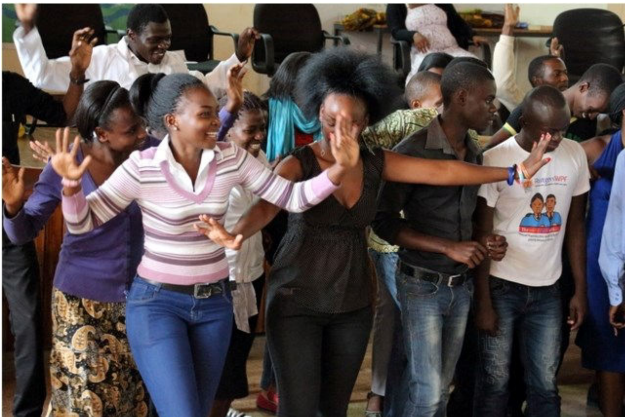
Students dancing to the tune produced by the various musical instruments during the Nile Project Workshop