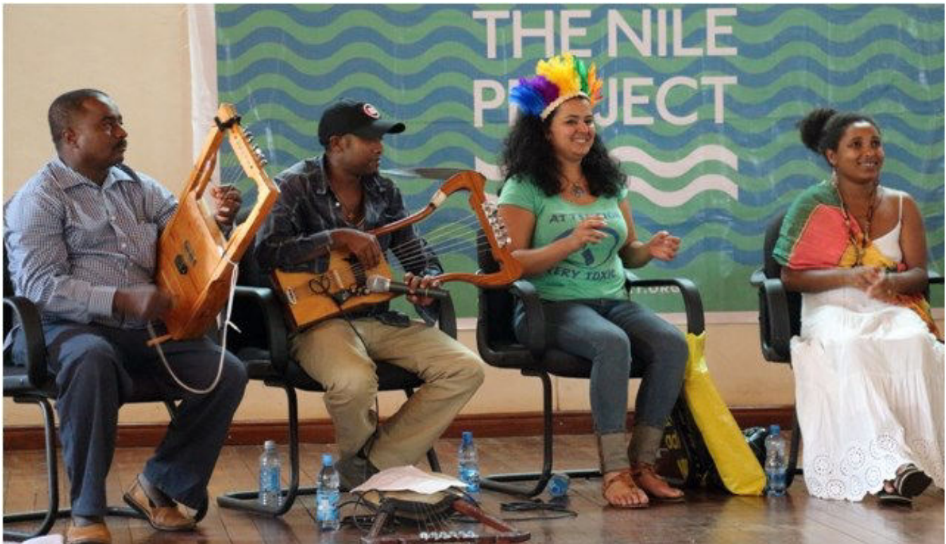
Nile Project Music team performing on stage at the Institute