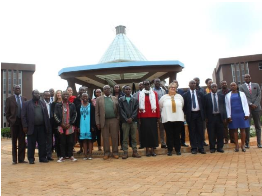
Group photo of participants during the Utu Conference on Community Engaged Scholarship and Advocacy on June 20, 2019

Wangari Maathai Institute (WMI) in partnership with James Madison University organized a one-day Utu conference on community engaged scholarship and advocacy on June 20, 2019 at the WMI Green Campus. The conference presented an interdisciplinary space for academicians and advocacy practitioners to dialogue with one another on issues related to the multi-dimensional ways in which collaboration and reciprocal partnerships can be activated between advocacy.