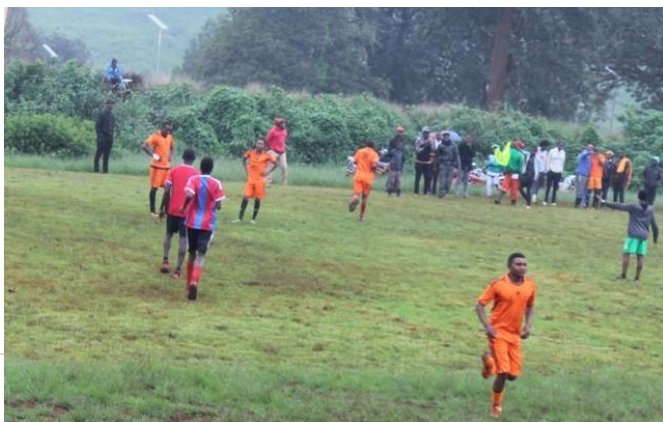
University of Nairobi (blue and red) versus Cooperative Bodaboda Sacco (orange) in action

Wangari Maathai Institute marked the World Environment Day sports activity on 5 th June 2019 by organizing a sports activity to enhance team spirit amongst the youth in Ndumbu-ini. The winner's trophy was donated courtesy of Kenya Association of Manufacturers. A total of 4 teams participated in the activity; kayole Mtaa Safi Initiative, One Stone Youth Group, University of Nairobi CAVS and Cooperation Bodaboda Sacco. The teams were divided into 2 pools. Pool A; One Stone Youth Group versus Kayole Mtaa Safi Initiative, the winner being One Stone Youth Group with 1-0. Pool B; University of Nairobi CAVS versus Cooperation Bodaboda, the winner being University of Nairobi CAVS with 3-2. The final match will be organized at a later date between One Stone Youth Group and the University of Nairobi in order to crown the World Environment Day Football Champions.