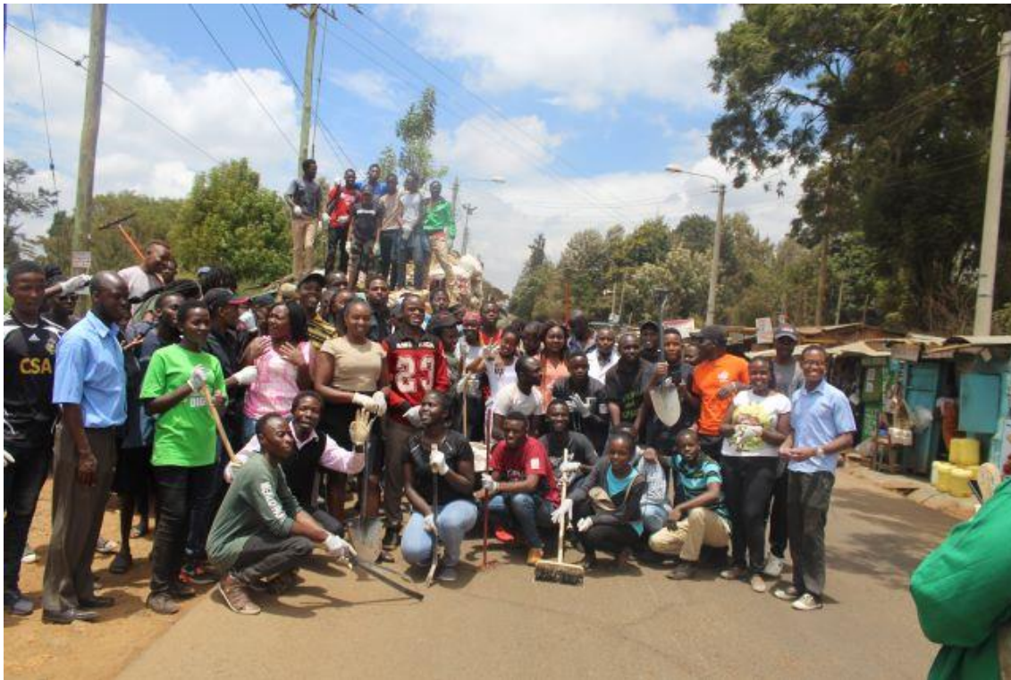
Group photo after the cleaning exercise