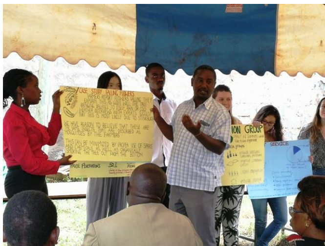
Students from the WMI-UoN, UoC and UoR, Denmark presenting their preliminary findings on macadamia farming

The Wangari Maathai Institute for Peace and Environmental Studies in collaboration with the University of Copenhagen and Roskilde University, Denmark successfully implemented the 2019 experiential field learning course dubbed, “ Sustainable Land Use and Natural Resource Management – (SLUSE), ” which is the 7 th in a series after the SLUSE courses in 2012, 2014, 2015, 2016, 2017 and 2018. The program was held in Kibugu, Embu County, from March 1-12, 2019. It incorporated students from various disciplines including environmental governance, agriculture, sociology, anthropology, economics, forestry, livestock production and law. The course was attended by thirty five (35) students of whom seventeen (17) were international students from both University of Copenhagen and Roskilde University and eighteen (18) from the University of Nairobi-Wangari Maathai Institute and the Department of Geography and Environmental Studies.